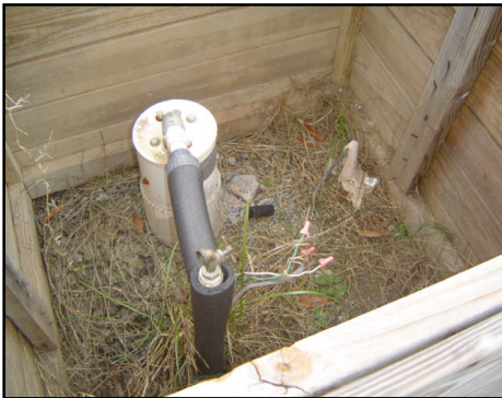
New Well Pump