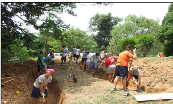
Volunteers Working in the Trenches

Maryland: The Technical Assistance Providers (TAP) have been intensely busy as a result of an unprecedented number of funding applications for projects that were "shovel ready" due to the persistent efforts of the Maryland TAPs. As a result, an unprecedented amount of funding has been awarded to multiple town and county projects. Over $15,000,000 has been awarded to date to Maryland projects!