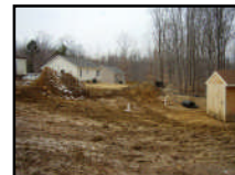
New Pump House (right) for Combined Well and Rainwater System Controls